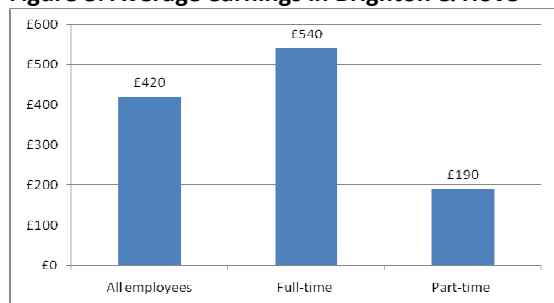
Figure 8: Average earnings in Brighton & Hove

The average gross weekly pay for all employees in Brighton & Hove is around £420 (Before tax etc), equivalent to a salary of around £22,360 per year. Full-time workers in Brighton & Hove earn on average £540 (before tax etc), per week or £28,080 per year. The average gross weekly pay for part-time workers is £190, equivalent to £9,880 per year 1 .